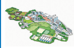
多摩キャンパス (東京都八王子市) Tama Campus Hachioji-shi, Tokyo

Vast campus with fully-realized facilities, located in the Tama area in western Tokyo, about an hour by train from central Tokyo. The rent in the area around the university is cheap, making it a convenient area for lifestyles.