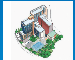
後楽園キャンパス (東京都文京区) Korakuen Campus Bunkyo-ku, Tokyo

Campus located in central Tokyo. Learn about the latest in science and technology from the heart of Japanese industry.